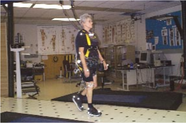
Test subjects in harnesses that contain monitoring sensors were put through the paces of walking and slipping. The harness prevented them from falling.

Falls are the leading cause of accidental death among people over the age of 75 and the second leading cause for those aged 45 to 75, according to the National Safety Council. Although the consequences of falling are well known, the relationship between aging and falling is still a mystery.